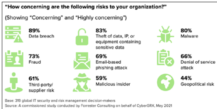
FIGURE 1-1: All these threats can be the result of bad actors targeting third parties.

Each of these attack modalities can be catastrophic if not detected and mitigated early on, and security professionals know this. In fact, as you can see in Figure 1-1, most respondents to a recent study conducted by Forrester Consulting stated that these were very concerning.